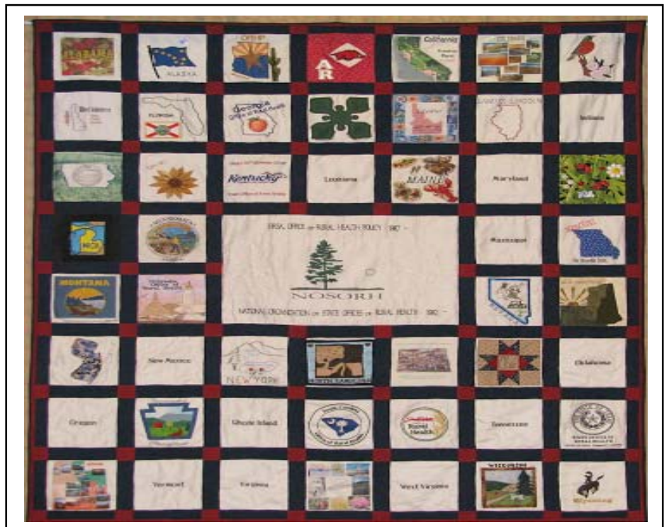
To celebrate the 20 th anniversary of the Office of Rural Health Policy, the National Organization of the State Offices of Rural Health presented the Office with this commemorative quilt

Hospital in Yazoo City, Mississippi (see page 4).