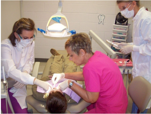
Sealant Day Event 2009 Northeast Regional Chapter of MOHCA Northeast Mississippi Community College