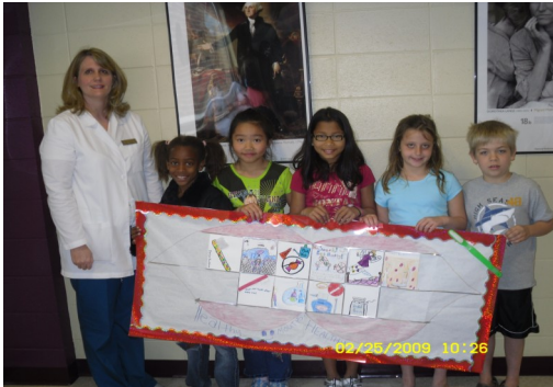
Healthy Mouth Healthy Schools National Dental Health Month Contest 2009 Oak Grove Lower Elementary