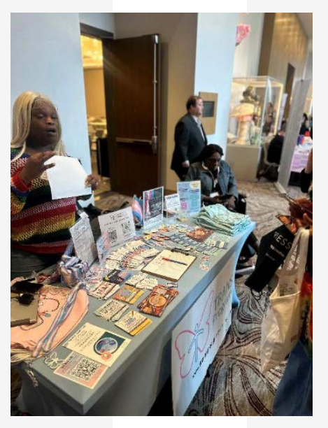
TRANS-Transgender Program Based out of Hattiesburg, MS