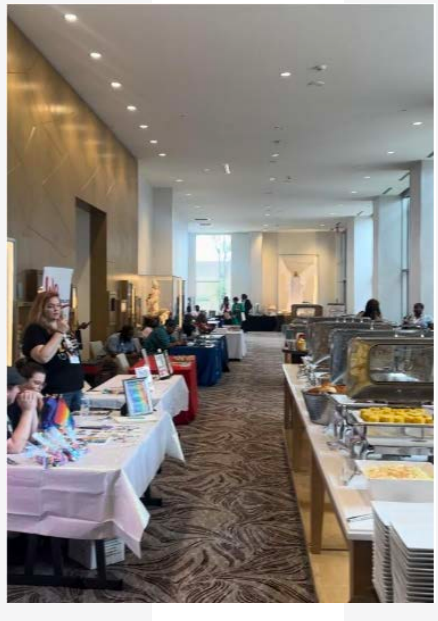
Team-ONE-Love 'Embracing Community & Culture'